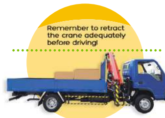
Fully retracted crane ✅